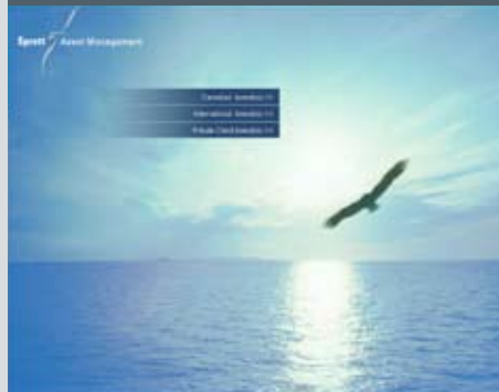
Sprott Asset Management Website