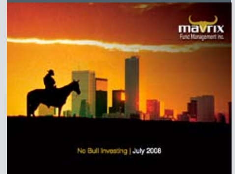
Mavrix Investor Presentation